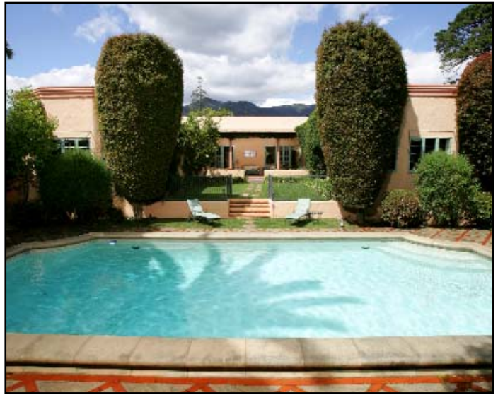
View of the courtyard from the pool.

tiled wet bar with flower arranging sink. A stairway leads to the private roof terrace.