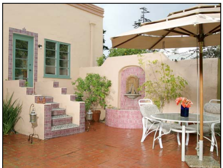
Courtyard off Bedroom #2