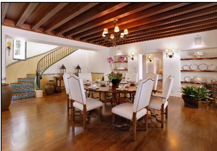
Dining Room with a curved staircase to the second floor.

A bright and open mahogany center island kitchen with wood floors and French doors and windows open to the side kitchen garden and a large (34' x 15') tile terrace. The old-world country kitchen will include stone and wood counter tops, top-of-the line appliances and a charming breakfast nook. Adjacent to the kitchen is a large walk-in Pantry, Mud Room and large Laundry Room all opening to the south facing kitchen herb garden.