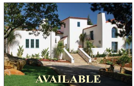
Bella Vista $5,990,000