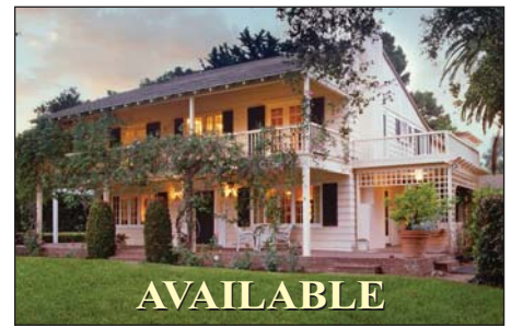
Pomar Price Upon Request