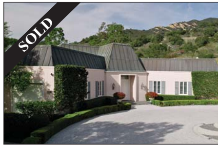
East Mountain $8,750,000