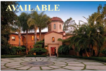
Las Entradas $17,950,000