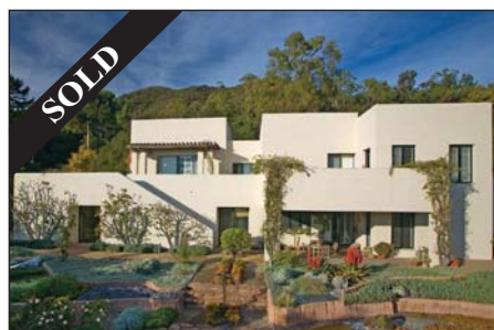
East Mountain $5,995,000