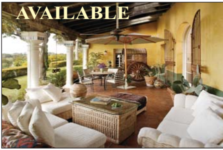
Via Bendita $28,900,000