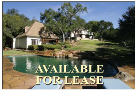
Park Lane $25,000 per month