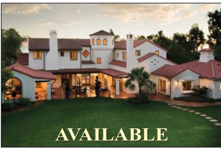
Las Tunas $5,950,000